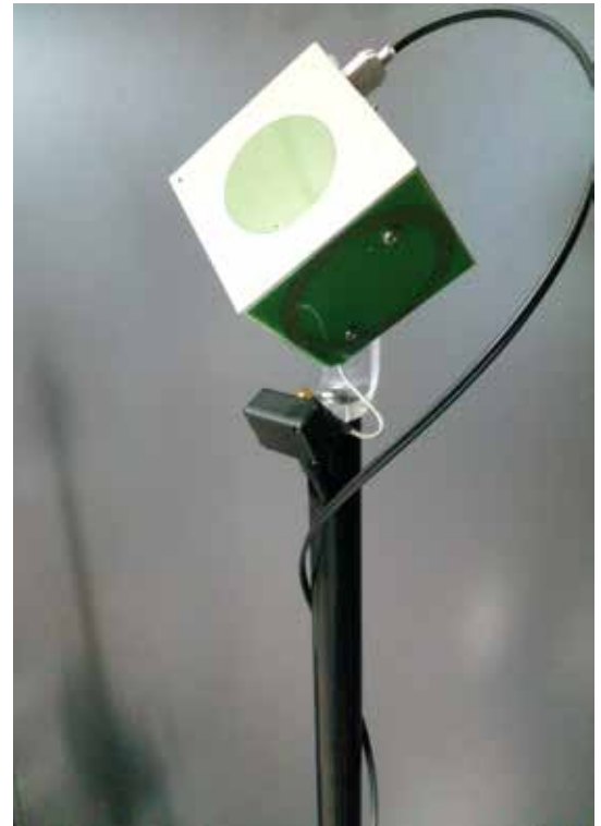
The electromagnetic field analyzer

The power supply is provided by a Ni-Mh battery, installed internally to the cubic housing.