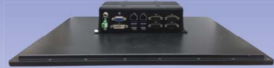
31385CW Back Panel