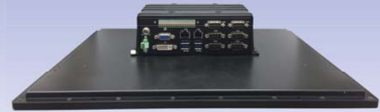
31385CW Back Panel (Option)