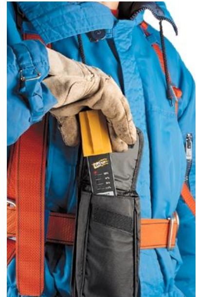
RadMan XT used as a personal monitor for radio frequency fields

As a locating unit all RadMan and RadMan XT versions can be used to locate leaks on waveguides and coaxial screw connectors (picture on the right). A non-conductive extension with handle is available as an optional accessory.