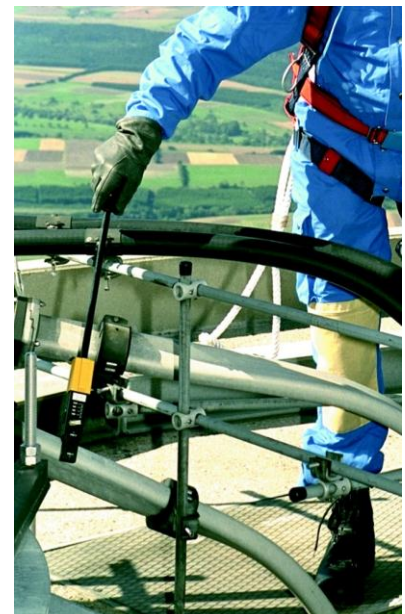
RadMan XT used as an instrument for leak detection